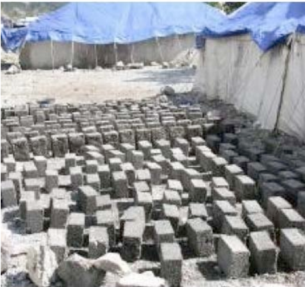
Building blocks for reconstruction purposes which can be produced from recycled building waste, Pakistan.