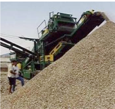
Recycled aggregate from crushed building waste in Kosovo, as used for road construction or low strength concrete foundations.